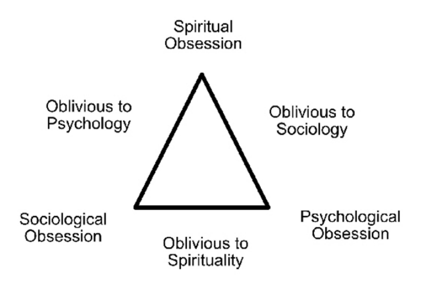
Figure 1 Individual Areas of Concern